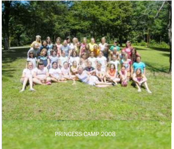
PRINCESS CAMP 2008