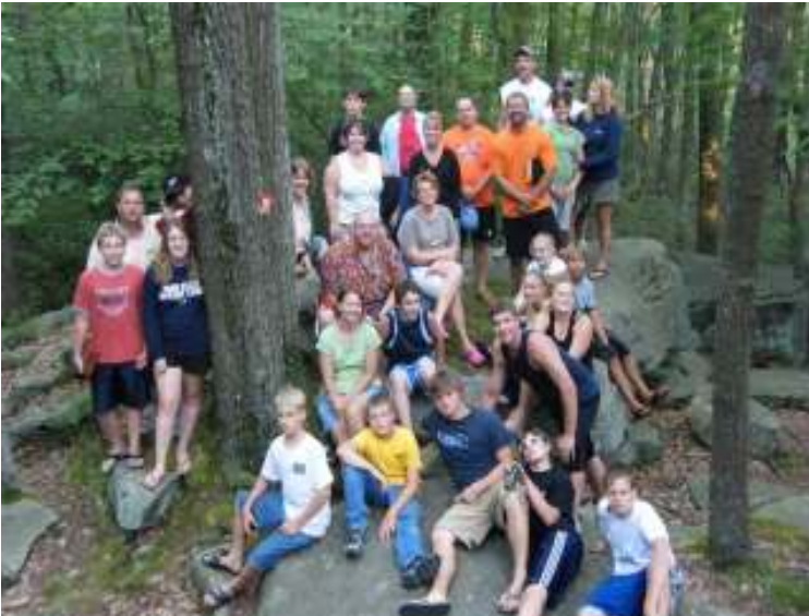
ADVENTURE ON THE MOUNTAINTOP

Held this past week at Christ is the Answer Retreat Center with thirty-two campers, teen counselors, and various ladies who helped. Women of the Bible was the theme!